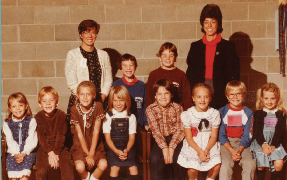
1st Grade Religious Education Class from 1984.