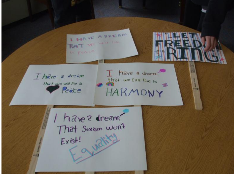
Signs made by our youth for the January 15th MLK March.