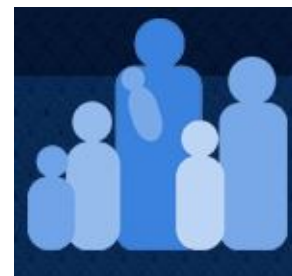
Community Dental Care

Thank you for your special gift of $6,140.00 received on December 20, 2017. Thank you so kindly for your compassion and love expressed to our patients in need. We will use the funding as for serving families in our Program to Improve Community Oral Health (PICOH), Minnesota Cavity Free Kids, and in providing mini-grants for those who are in desperate need for dental treatment and do not have any funding in Rochester. Thank you to the Social Justice Council for nominating Community Dental Care for this generous funding .